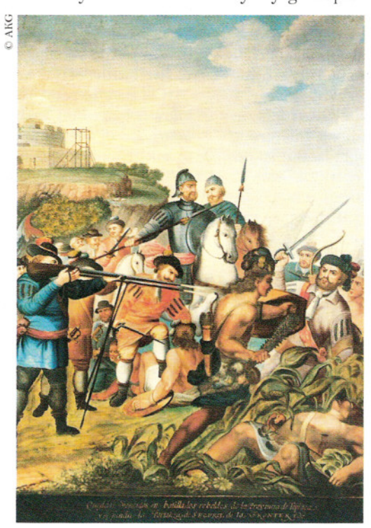
The conquest of the New World destroyed indigenous populations and languages

It may be too late. "If only my grandpar-