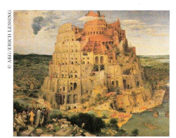
The Tower of Babel by Pieter Breugel

Diversity occupies a central place in evolutionary theory because it enables a species to survive in different environments. Increasing uniformity holds dangers for the long-term survival of a species. The strongest eco-systems are those which are most diverse. It has often been said that our success in colonising the planet can be accounted for by our ability to develop diverse cultures which suit different